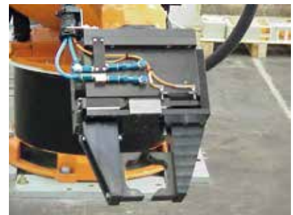
Pump housing gripper